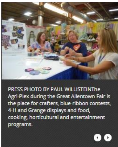
The Agri-Plex during the Great Allentown Fair is the place for crafters, blue-ribbon contests, 4-H and Grange displays and food, cooking, horticultural and entertainment programs.

I certainly could not have functioned in this capacity without the help of many members who volunteered to help at the various shows or to promote the quilt on our website and through virtual craft shows. I will be forever grateful for all you did to help this "newbie" survive as well as thrive in this position.