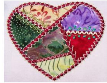
Crazy Quilters' Quilt Guild 1990 - 2020

"Still crazy for quilting after all these years!"