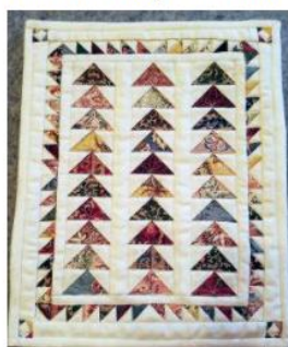
Deb Veshinsky - 2nd Place