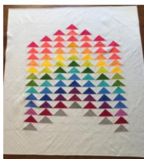
Suzanne Nelson - 2nd Place