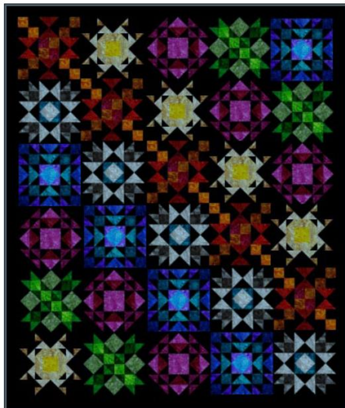
Test Block #1

The fabric I ordered to match the adjacent pictured quilt was shipped from SD on 12/17/20. Since it has not yet arrived, I made tests of Blocks #1 and #2 out of black and white (and white and black) fabrics. I really like them, so I'm sure that those of you using your stash will be pleased with your choices. Using a pressing bar that came from www.thestripstick.com , I pressed all seams open. Use a SCANT ¼" seam, and your blocks should fit together perfectly. There is no charge for the pattern. I will include the Block #1 pattern in the next Newsletter so participants can make a test block and get started as planned.