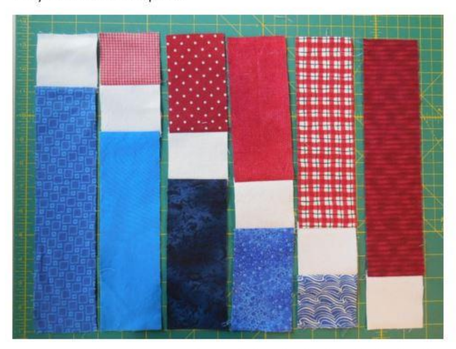
Step 2 – Sew the columns together. It's that simple. Your block should measure 12-1/2 x 12-1/2 inches.