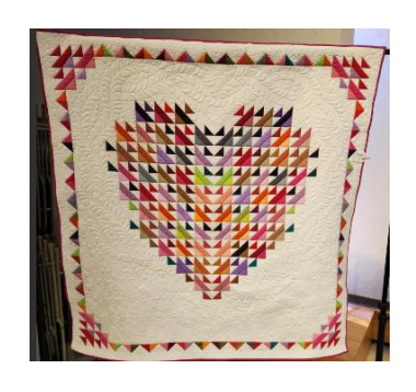
3<sup>rd</sup> – Debbie Heeps