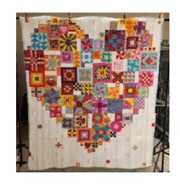
2<sup>nd</sup> - Linda Wojciechowski